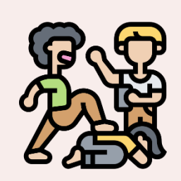
Domestic violence, physical abuse